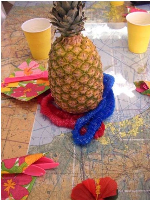
The tables looked very Hawaiian