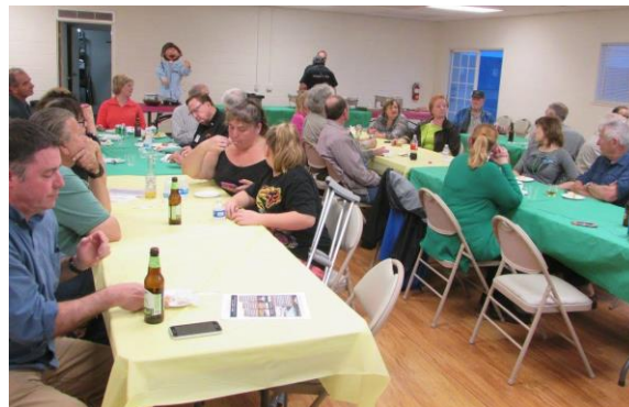
Members and guests enjoying their evening.