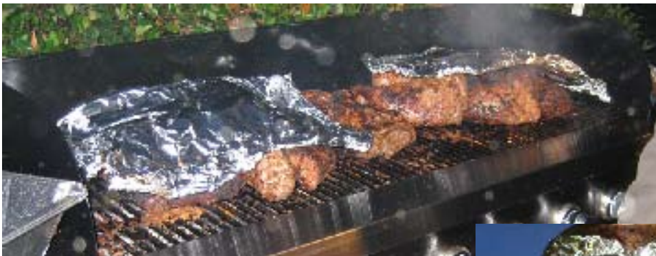
OF COURSE A GRILL FULL OF TRI TIPS IN A HOME- MADE SECRET RUB.....