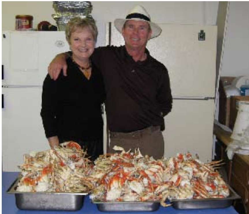
MAIN COURSE CRABS, CRABS, CRABS, CRABS, CRABS AND MORE CRABS