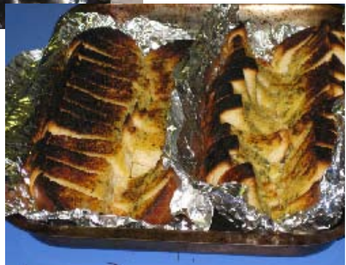
WHAT DINNER WOULD BE COMPLETE WITHOUT FRESH HOT GARLIC BREAD.