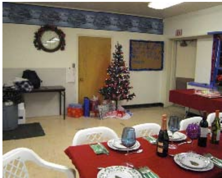
Our new MDPA Christmas Tree