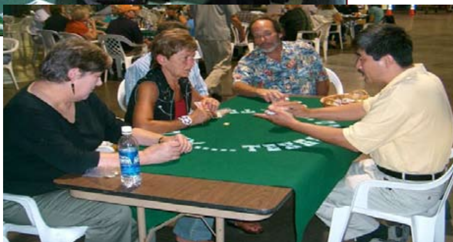
Texas Hold-em Poker