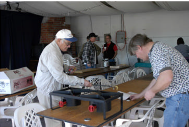
Chief cook and Bottle Washer