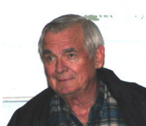
The Master Planner